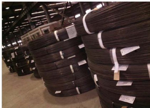
Indented PC wire in rolls

Available with two-sides, three-sides, or four-sides indents, indented PC wire with round, ellipse or rhombus shape surface treatment can heavily combine the steel wire with concrete.