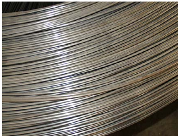
Cold rolled plain PC wire in rolls

Plain PC Wire, also called plain surface PC steel wire or smooth PC wire, features low relaxation and high tensile strength, ideal for concrete structures.