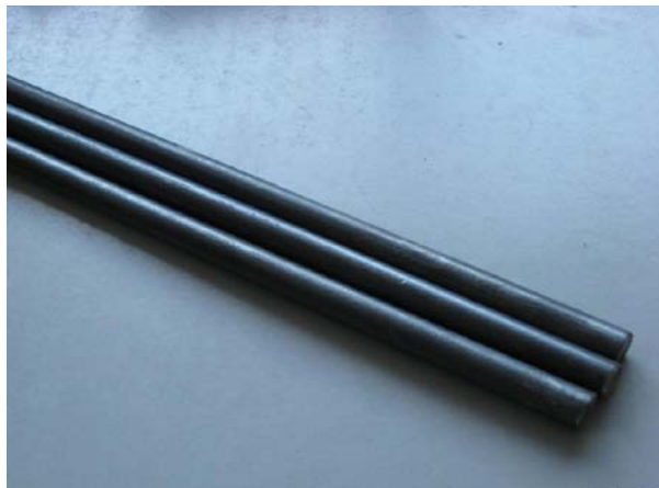
Low relaxation plain PC wires