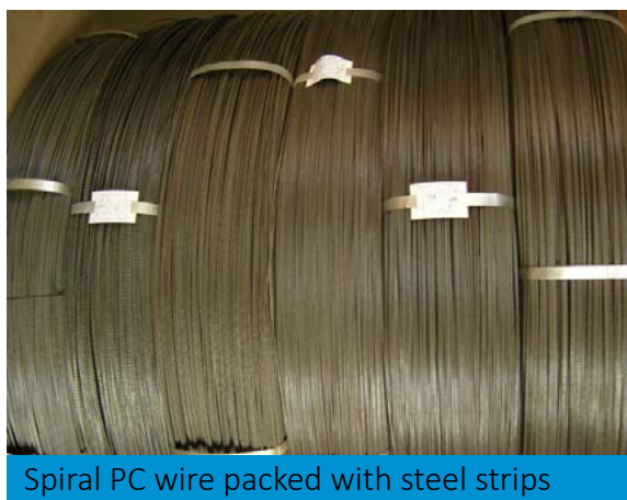
Spiral PC wire packed with steel strips

Spiral PC wire with spiral ribs can obviously strengthen the combination between wire and concrete, thus increasing the performance of the PC construction structure and extending its service life.